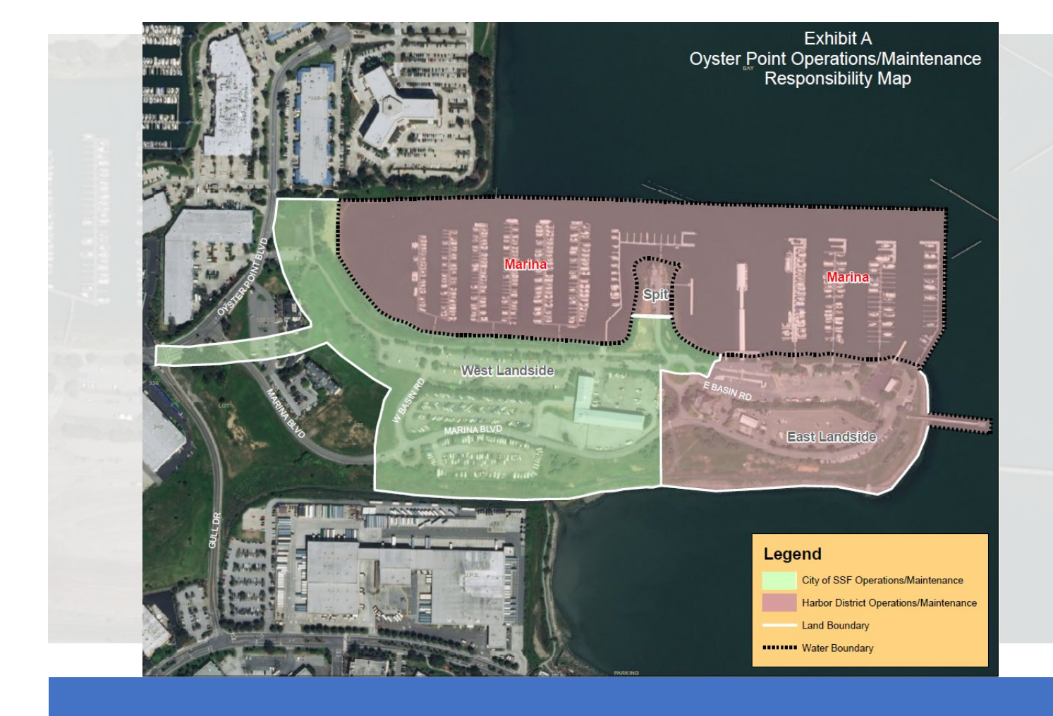
Exhibit A: Marina Map