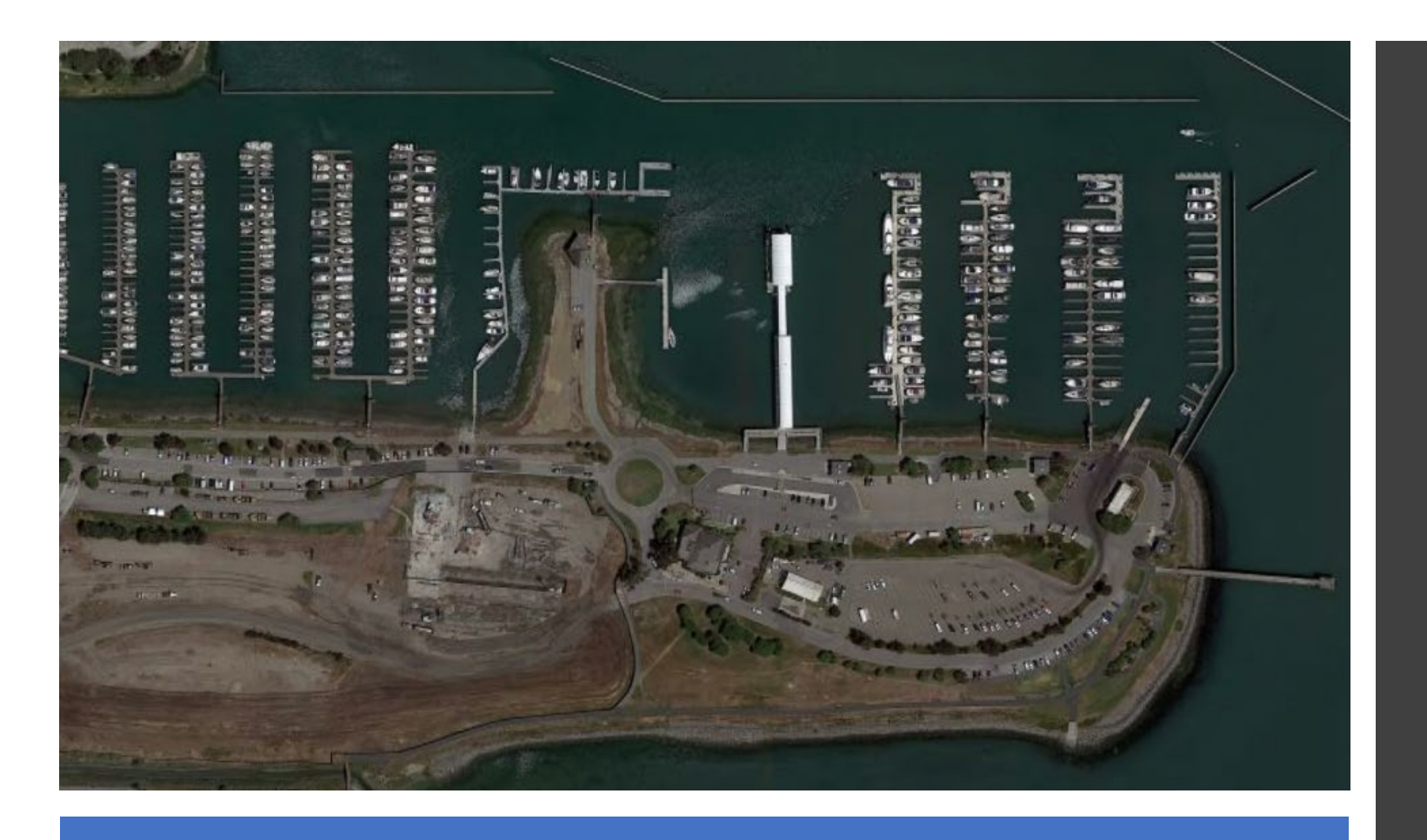
Exhibit D: Operational Performance Indicators (OPIs)