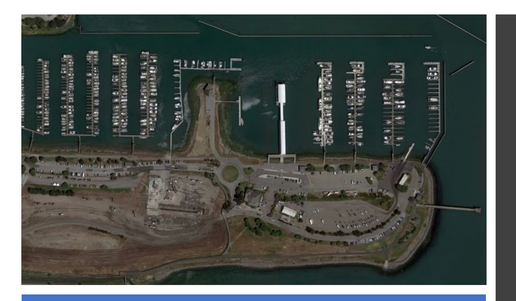
Exhibit D: Operational Performance Indicators (OPIs)