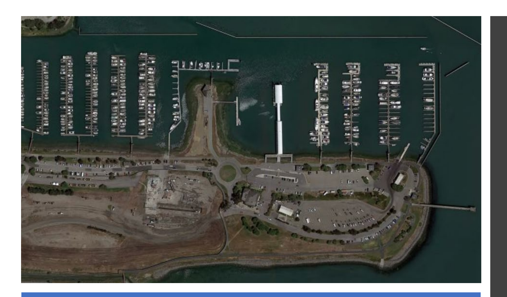
Exhibit B: 2011 Agreement